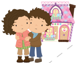
Hansel and Gretel