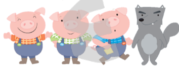
The Three Little Pigs