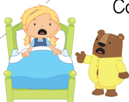
Goldilocks and the Three Bears