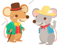
Town Mouse, Country Mouse