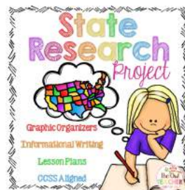
State Research Project