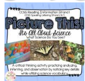
Science Picture of the Day