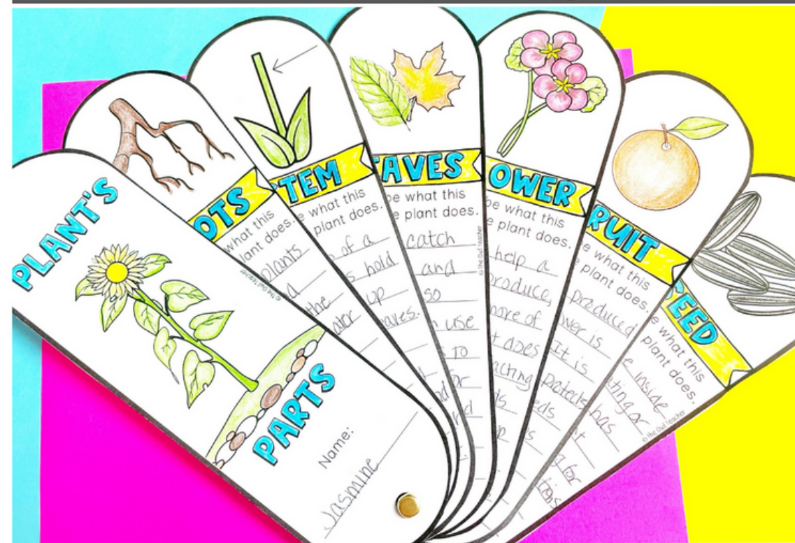
FAN BOOKLET ACTIVITY