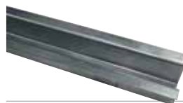
ACG5481 CHAIN PROTECTION GUIDE to fit at floor level L = 2 m