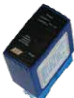
ACG9064 METALLIC MASS DETECTOR to open with vehicles 2 channels - 12÷24 Vac/dc