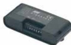
ACG9060 METALLIC MASS DETECTOR to open with vehicles 1 channel - 230 Vac