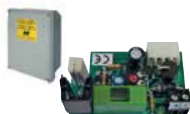
ACG5482 BATTERIES CHARGER STOPPER (need 2 pieces of ACG9511) with plastic container