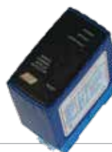
ACG9063 METALLIC MASS DETECTOR to open with vehicles 1 channel - 12÷24 Vac/dc