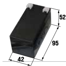
ACG9511 BATTERY 1,2Ah 12V (order 2 pieces for each ACG5482)