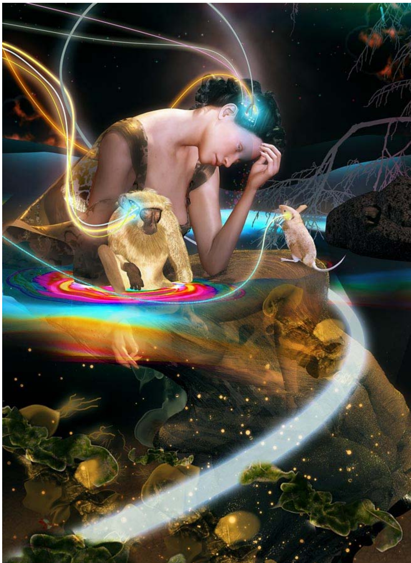
Illustration: Justin Wood

In the summer of 2007 , a team of Stanford graduate students dropped a mouse into a plastic basin. The mouse sniffed the floor curiously. It didn't seem to care that a fiber-optic cable was threaded through its skull. Nor did it seem to mind that the right half of its motor cortex had been reprogrammed.