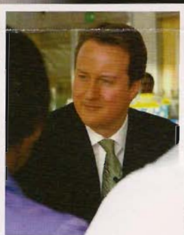
Man with a plan: David Cameron